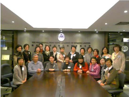
First Party with GMNs on 3 December 2013