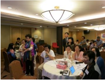
Participants were very involved and attentive.