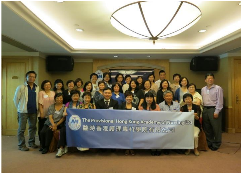
Council members and colleges' representatives

In the Strategic Planning Workshop, Vision, Mission and Objects of PHKAN were revisited and action steps in achieving the objects were identified. Please refer to www.hkan.hk for the full version of PHKAN objectives.