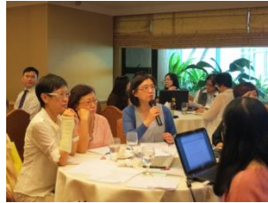
Actively participated in group discussions