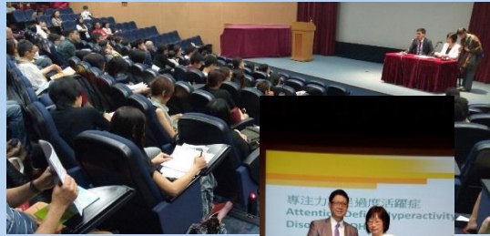
ADHD Health Talk On 26 September 2015