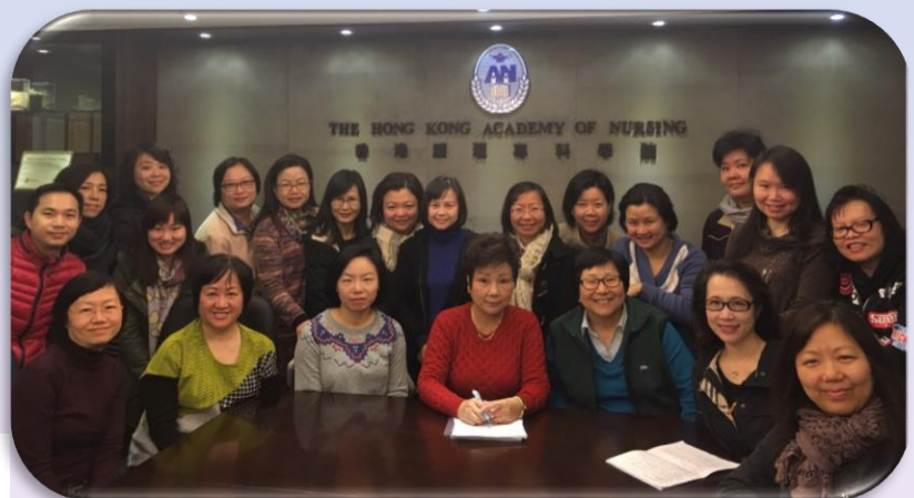
1 st recording on 20 th December 2015. Host, guests and actors.