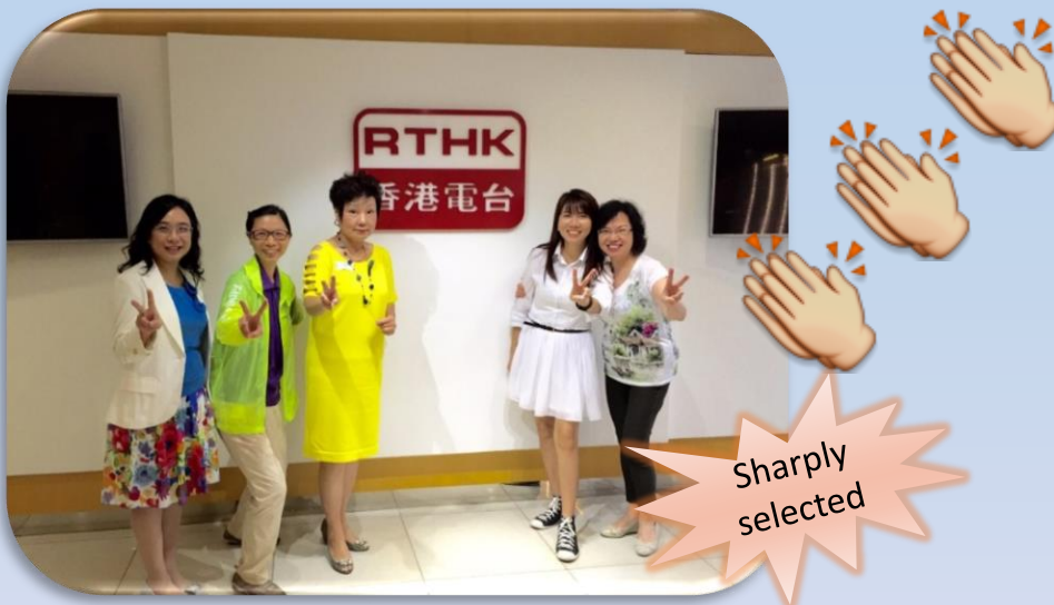
CIBS core members attended the selection interview at RTHK on 26/9/2015

Follow-up for Fellow-networking (3F) Work Group applied for the Pilot Project of the Community Involvement Broadcasting Service (CIBS) in July 2015 with a view to promote specialization of nurses through a program called Journal for Healthy Elders. (健康老友記雜誌)