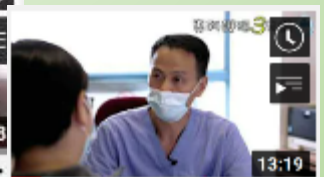
專科護理3分鐘(10) - 骨質疏松 你要知