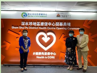
Opening of the 2 nd DHC (Sham Shui Po) on 18 October 2021

The first DHC started operating in Kwai Chung since September 2019 and the second one was opened in October 2021. The government is gradually setting up district health centers in 18 districts in Hong Kong, to provide Primary healthcare services for residents in the district including health promotion, health assessment, chronic disease management and community rehabilitation, will be provided to raise public awareness on personal health management, enhance disease prevention, and strengthen medical and rehabilitation services in the community.