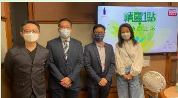
Interviewed with HKCERN on 9 Nov 2021