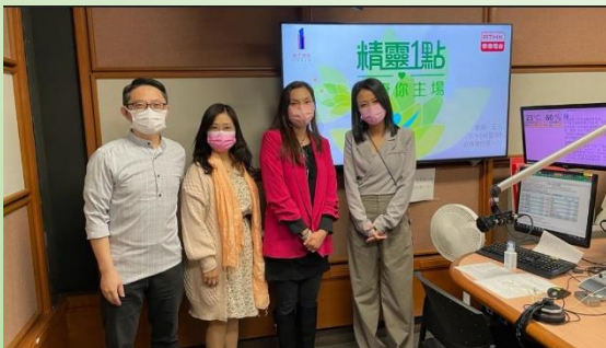
Interviewed with HKCGN on 14 Dec 2021