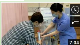
專科護理3分鐘(12) - 慢性腎病 有出路