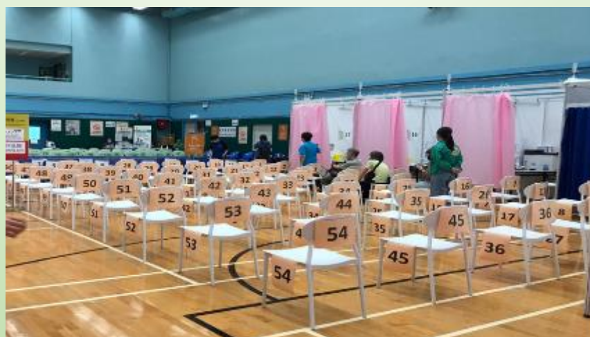
The Boundary Street Sport Centre CVC