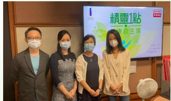
Interviewed with HKCMW on 12 Oct 2021