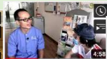
專科護理3分鐘(11) - 藥物濫用