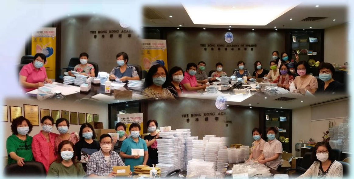
working with the volunteers