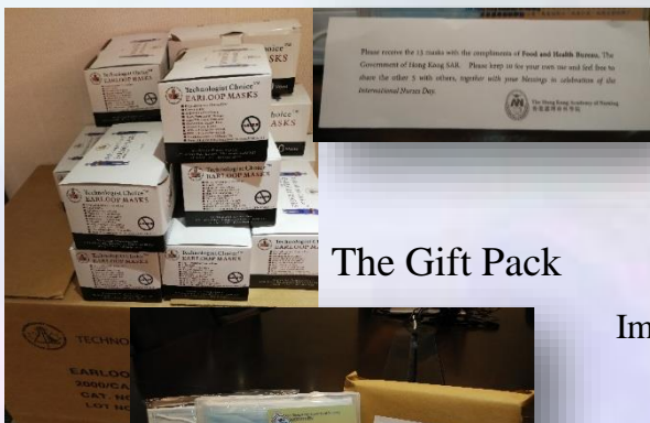
The Gift Pack