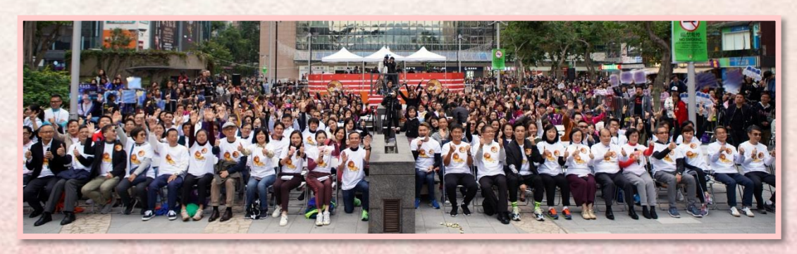
08 December 2018 Attending Move for Health by Department of Health