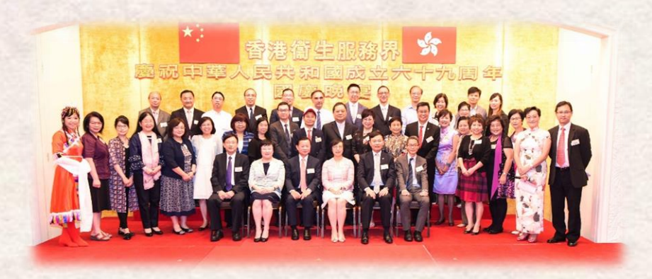
21 September 2018 at the 2018 National Day Celebration