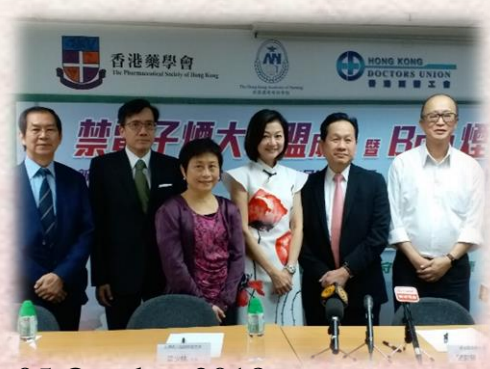
05 October 2018 「禁電子煙大聯盟」成立 暨 Ban 煙行動啟動發佈會

29 September 2018 Breast Cancer Awareness Campaign at Causeway Bay. Over 1,000 public attended the selfexamination education