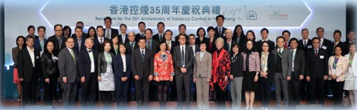
1 December 2017 Attending 35 th Anniversary of Tobacco Control in Hong Kong