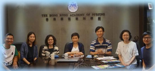
19 September 2017 Meeting with representatives from Society for Community Organization (SOCO)