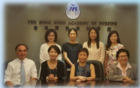
29 September 2017 Meeting with Nursing Heads and representatives of School of Nursing of CUHK, HKPU and HKU