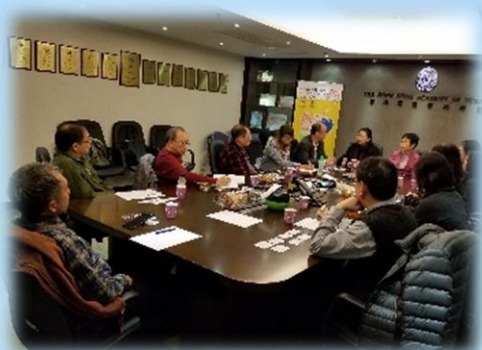
18 January 2018 Meeting with Patient Support Group