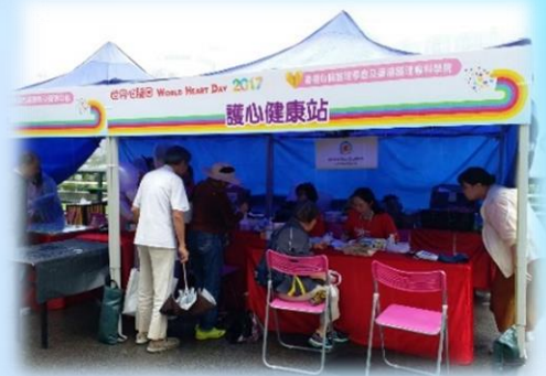
12 November 2017 Participating in the World Heart Day