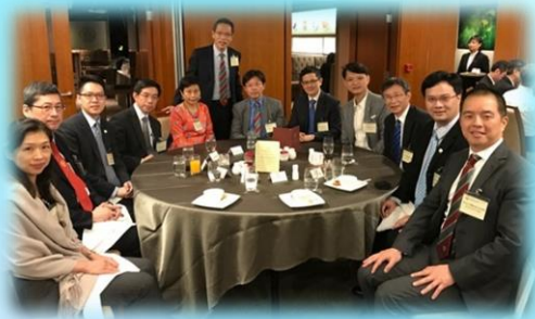
27 July 2017 Dinner with Medical representatives of Hong Kong Academy of Medicine