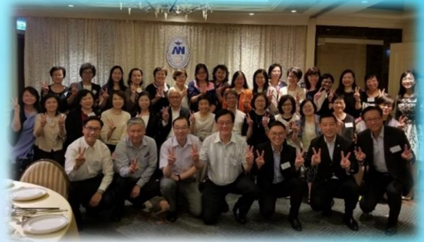
19 September 2017 Fraternity Dinner with Nursing Heads of HA hospitals