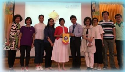
22 September 2017 Participating in Youth Caring Program of UpPotential