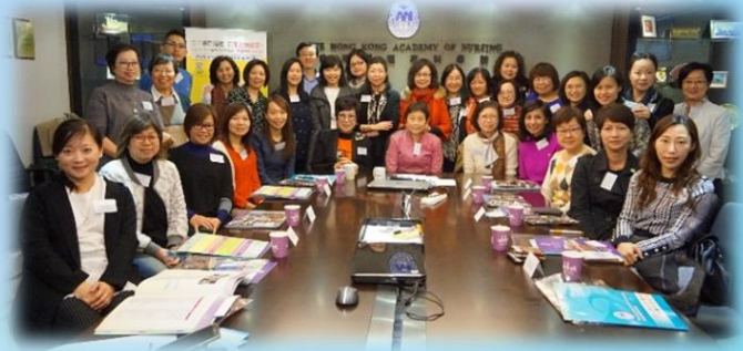
16 December 2017 Fraternity Lunch with Nursing Heads of private hospitals