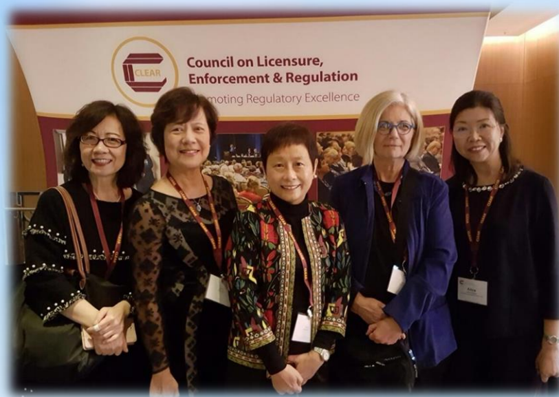
The 5th International Congress on Professional and Occupational Regulation in Melbourne

In conclusion, we were glad to realize that HKAN is in the same direction and pace as other international professionals to develop and regulate our own professional practice. In the future we shall participate actively in the international forum and arena in advanced nursing practice development; and network and partner with regulatory bodies and education institutes to devote HKAN in this leadership. HKAN will continue to strive towards setting up the Hong Kong Academy of Nursing as a statutory body aiming at accrediting and regulating advanced practice nurses in order to safeguard the public’s interest to receive safe and quality health care services. HKAN is committed not only promoting the improvement of nursing care by developing continuing education for nurses and midwives but also fostering a spirit of collaboration in the nursing community through constant updates, exchange of information among nurses and health practitioners; and involve publics/community stakeholder for advice in the professional services.