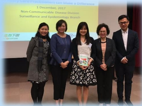
1 December 2017 Attending Alcohol Screening and Brief Intervention ceremony held by Department of Health