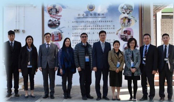
11 December 2017 Visiting Correctional Services Department