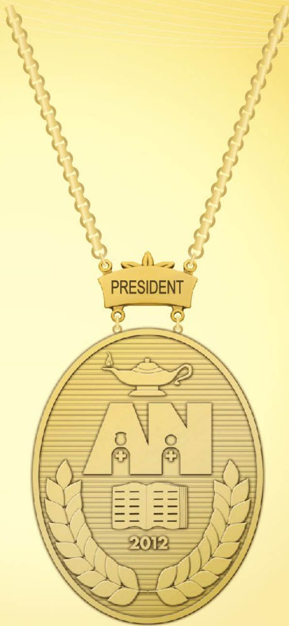
CHAIN OF OFFICE